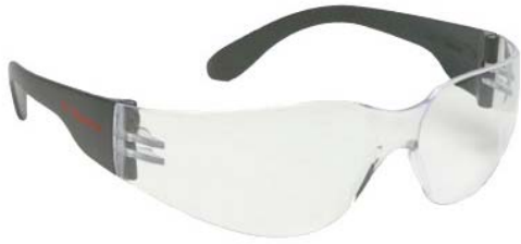
Basic Safety Glasses

materials at work, consider employment elsewhere! If this is not possible, for whatever reason, safety glasses can be purchased at hardware stores, or on-line at many websites.