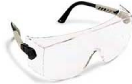
Over-Glasses Safety Lenses

It's important to remember that once you lose your sight, it is never coming back, so prevention of eye-related injuries is KEY . Safety glasses come in many forms, and can be worn alone, or larger sets can be purchased that will fit over your eyeglasses.